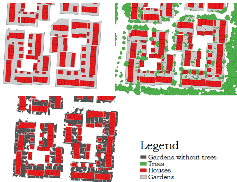
Figure 2: Processing of removing trees (Own edit of data, 2024)

The second issue with the satellite images that we looked at was the obstruction of vision that trees cause. As mentioned before, trees obstruct vision of the gardens from above. Thus, we took out the trees from the dataset and were left with a garden data set where we can observe what is happening within the gardens. See figure 3 for a visualisation of this process.