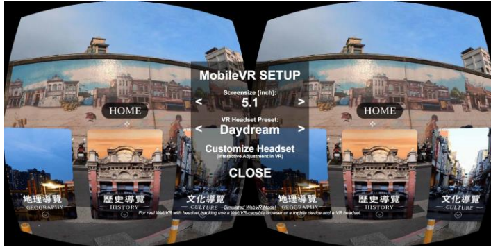
Fig. 3. Web VR Device Focus Adjustment Screen

the function bar and to maintain the scalability of future additions during the design process. A crosshair gaze and point-to-point depth of scene movement are used to improve the overall smoothness of the operation. In terms of auxiliary optimization, the auxiliary modes provided in the library software allow for modularized picture correction according to the needs of different VR devices and individual focal lengths.