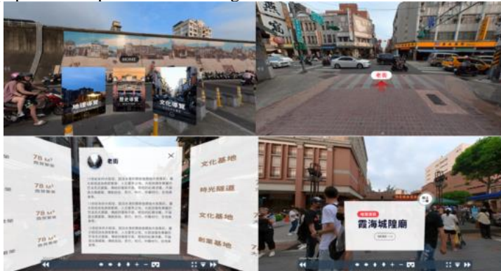
Fig. 2. Web VR Information Navigation System Interface

On the WebVR interface, our research takes a case study location in Taipei Dadaocheng. On the WebVR navigation screen, the user can see VR on the web page from the Taipei Dadaocheng field as the WebVR service platform. The general navigation page mainly provides the choice of scene theme (as shown in Figure 2). The prototype also provides three auxiliary functions: VR and panoramic screen activation, manual field view adjustment, visual screen size, and scene switching. Afterward (as shown in Figure 3), you can adjust and optimize the tour experience according to different VR equipment and personal focal length.