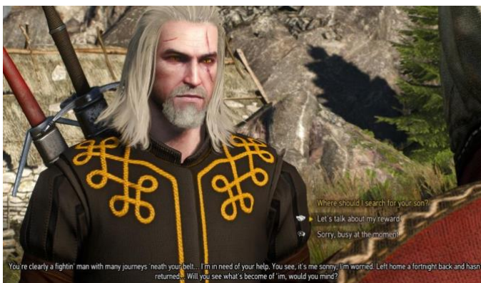
Figure 3: Geralt's responses to the man's plight: "Where should I search for your son?"; "Let's talk about my reward" (initiate negotiation); "Sorry, busy at the moment".

One of the ways such a boundary was drawn was in Geralt's avatar. Geralt as the player's vessel is significant because the repetitious and evocative narrative force of Geralt's oppression permeated my play style. The stereotype that Witchers have an inherent and insatiable love of money is feed for their public hatred and inferior social standing. Financial negotiations almost always arise when Geralt accepts quests from characters, allowing the player to barter via a slider that accommodates the NPCs (non-playable characters) "annoyance level." NPCs were sensitive towards Geralt's negotiations and did not hesitate to comment on the social significance of the transactions with tongue-in-cheek comments, like: "I know Witchers don't work for free." Other times, the player can choose to insist on a reward or offer gratuitous services, a decision seemingly free and up to the player's discretion. If engrossment is active, every previous encounter goes on to shape the next one. Times where I was treated crudely provoked aggression, whilst graceful encounters brought on more sympathy.