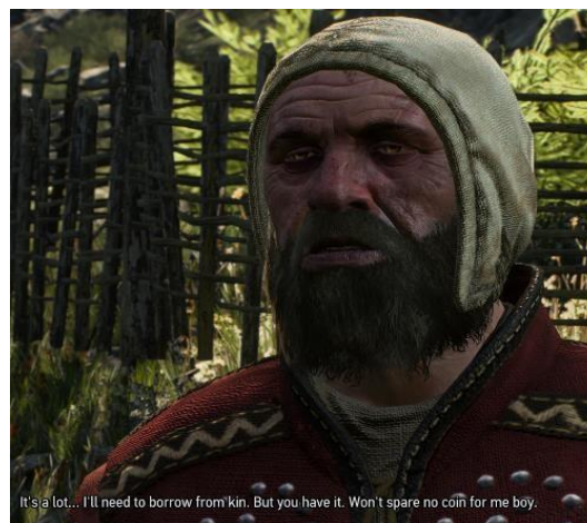
Figure 4: The man's response to a high barter: "It's a lot... I'll need to borrow from kin. But you have it. Won't spare no coin for me boy."