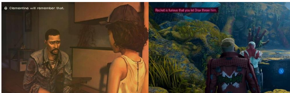
Figure 1: "Clementine will remember that." (left)

On-screen textual commentaries act as a kind of ludic feedback—rewarding, acknowledging, or reproaching a player's decisions and subsequent effects on a storyline and its characters. These intra-game messages recall one of Salen and Zimmerman's fundamentals of 'meaningful play' as such feedback provides an imbued weight to players' decisions. 5