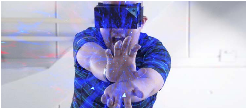
Figure 1. Everyone can shoot the magical skills by the “HADO” in the real world.

"HADO" is the combination of Augmented Reality (AR) technology, motion sensor, Head-mounted display (HMD), smartphone, and sports that creates a whole new experience that we call "Techno Sports". By wearing the arm sensor in the arm and HMD to the head, adding the AR technology, HADO actualize magical worlds everyone dreams of as a child. Shoot energy balls to smash opponents and use the shield to prevent opponent's attacks!! Think strategic, move like a lightning, and coordinate team play to flight your opponents. This is a HADO Players vs. Players battle!!