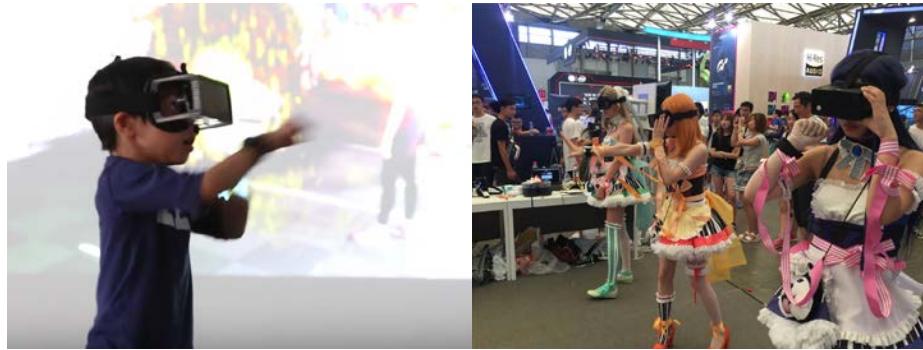
Figure 4. The various players of HADO

HADO is running as attraction or activity at mainly leisure facilities, shopping mall. For instance, domestic permanent use case is HUIS TEN BOSCH[5], NAMJA TOWN[6] and VR Center at AEON LakeTown[7]. Overseas permanent use case is JOYPOLIS at Qingdao China[8]. Temporary event use case is more than 70 locations. Depends on the situation, max capacity per day is 1,000 players. Over 600,000 people play HADO so far. Various players (friends, families especially children, couples, cosplayer) enjoy HADO for each purpose (Leisure, Sports, Exercise, Cosplay), core players play so many times.