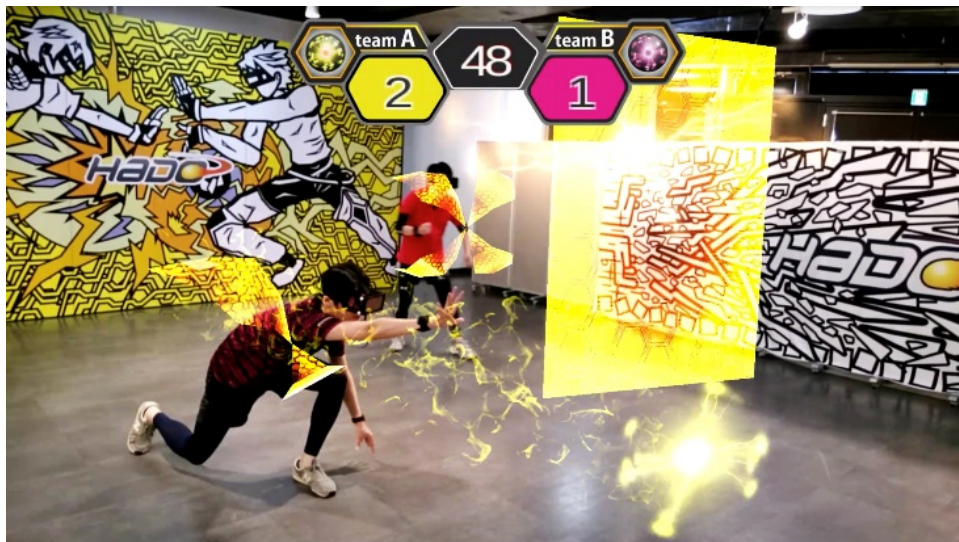
Figure 1. The play capture of HADO

"VOID"[2] and "ZERO LATENCY"[3] can be cited as a similar service. It's different in that they using VR technology and heavy equipment like gun. The experiences are like FPS game. HADO need so light equipment than theirs because of no backpack PC. HADO players can move sharply just like other sports.