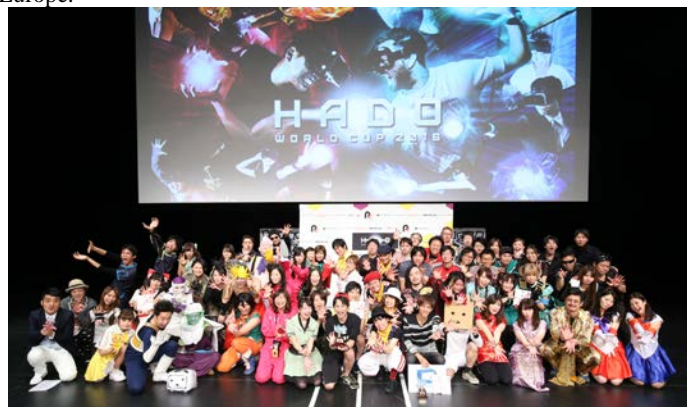
Figure 5. HADO WORLD CUP

In 26 Nov 2016, HADO WORLD CUP[9] was held at Tokyo as the world's first techno sports competition with prize money. The applying team number is almost 4 times to limit on participation, 16 teams and about 50 players participated and fought a hot fight. Approximately 33,000 audiences cheered mainly on web live streaming. HADO WORLD CUP will be held every year, and next time we'd like to invite players from Asia, North America, and Europe.